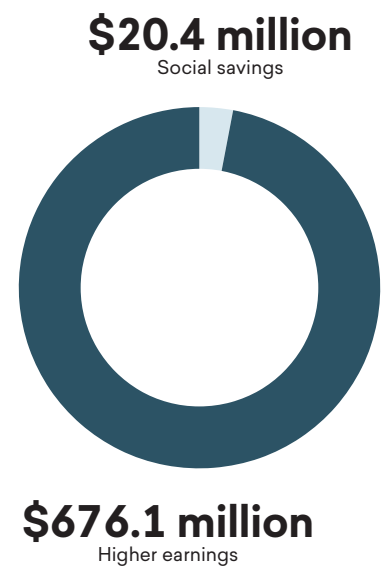
FIGURE 3: Present value of higher earnings and social savings in Oregon