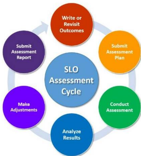
Figure 1: Assessment Cycle at COCC

In addition to the general education outcomes work described earlier, COCC has in recent years put an increased focus on supporting the development of concise and measurable outcomes at all levels. The director of assessment and curriculum created a Faculty Tool Kit for instructional assessment, which includes guidance on developing learning outcomes as well as before-and-after examples of outcome improvements. A more recently added resource is a Canvas course called SLO 101: Student Learning Outcomes Orientation . This is a self-paced course available to all faculty that teaches its users about the rationale and purpose of outcomes assessment, COCC's assessment cycle, how to evaluate existing outcomes and create improved ones, and also contains guidance about assessment. The director of assessment and curriculum has also held individual consultations and group workshops with faculty who are working on revising their outcomes.