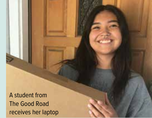
A student from The Good Road receives her laptop

The STRIVE program itself has students coming from all over the state to stay on campus for four days to explore the college experience through several workshops on different careers—everything from business, fire science, writing, mathematics and more. It also includes a few lessons on basket weaving and first foods. Participation in STRIVE earns the students a college credit. (The Good Road