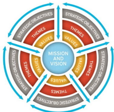
Figure 1: COCC planning model

The College’s mission and vision are at the center of the institution’s planning and assessment model, as illustrated by figure 1. Institutional values 9 , themes, and strategic objectives serve as the environment and organizational structure by which the College works to achieve its mission and vision.